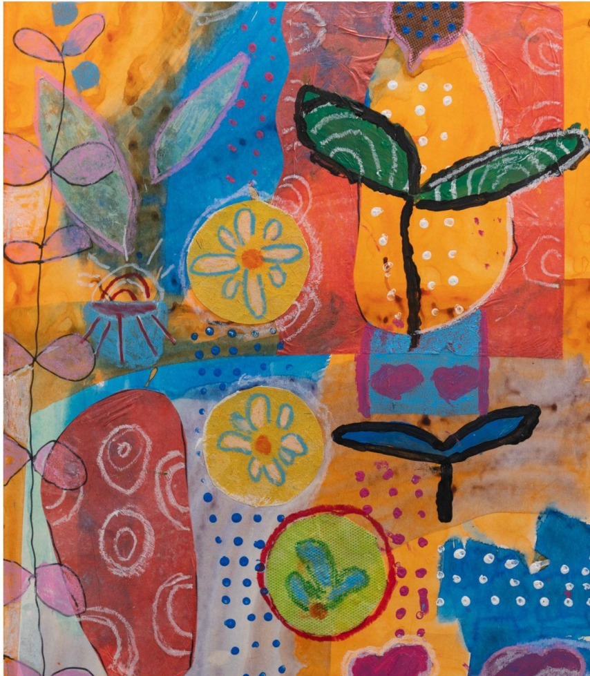
Abstract Foliage - Katherine Cook