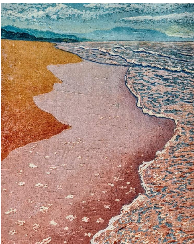
Rowan Simmons - 'Kjerokipah'