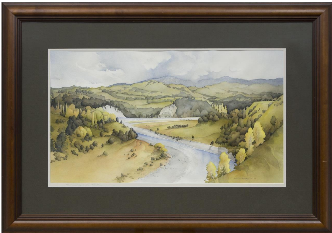
David Henshaw watercolour

Butterfly print from stamp blocks demonstration with the Plateau Printmakers.