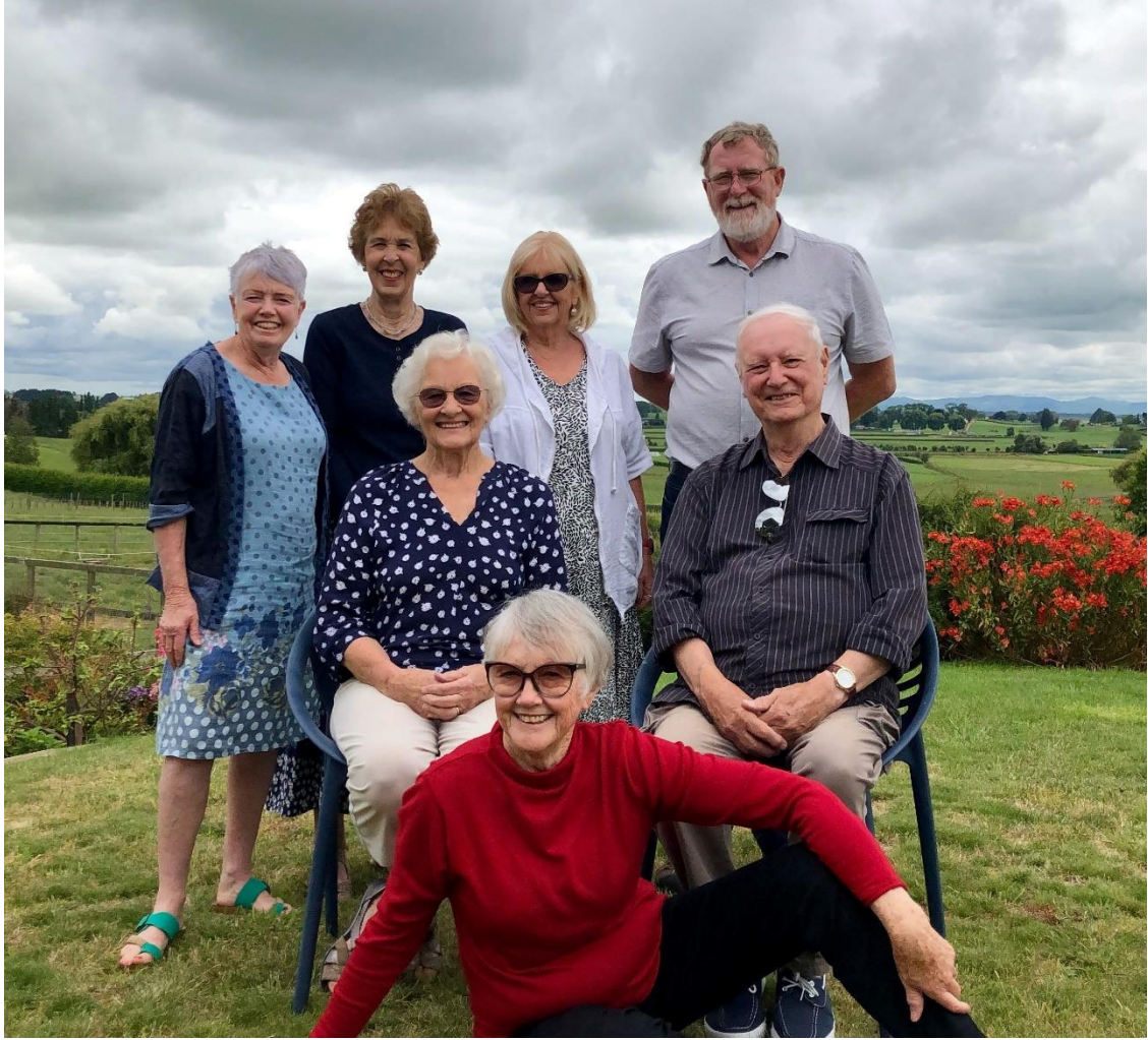
The Monday Group