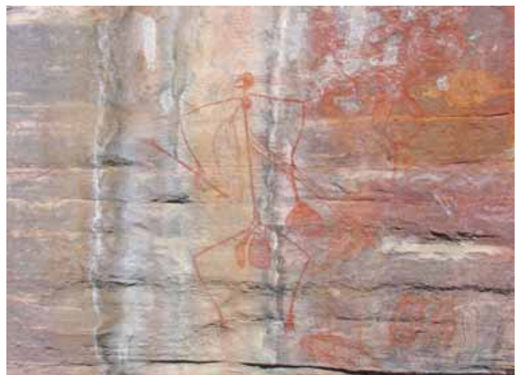
Well hung art.

For more information see: www.aboriginal-art-australia.com