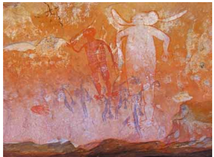
'Ricketts Blue Painting'.

A variety of techniques are used. The simplest is the stencil technique where pigment is taken into the mouth and spattered at an object such as a hand held against the rock. Feet or utensils or weapons may also be used as stencils. Other methods involve the preparation of brushes (by beating Pandanus roots) and pigment (by grinding ochre or other pigments using grinding stones in rock holes). It appeared to us, from the location of some of the art, that scaffolds of some sort had been used to obtain access to sheltered walls. Pigment was obtained from well-established ochre pits, from haematite deposits and from charcoal. Occasionally blue pigment is seen, this being usually of modern origin.