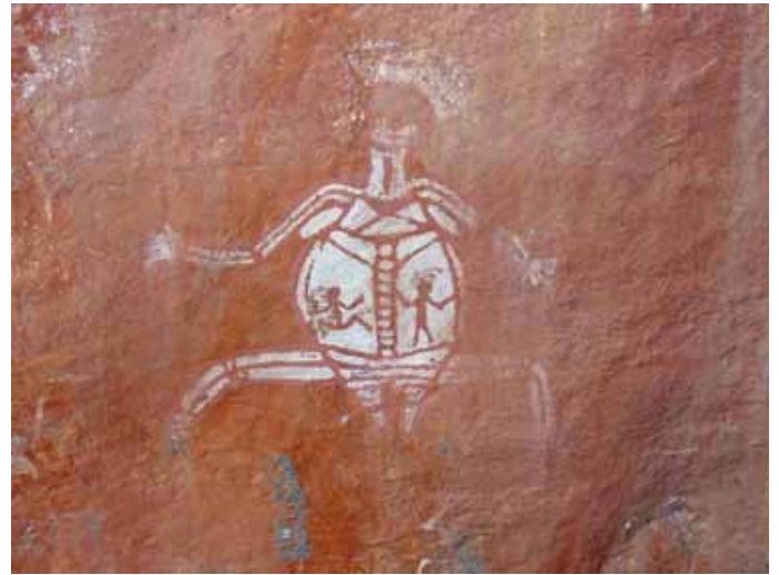
Female body depicting twins.

As might be expected, the art often depicts activities and subjects related to the hunter-gatherer and cultural activities of their lives. Animals are often shown in 'X-ray' style, not all that unexpected when you consider that the final result of a hunt is to reduce the animal to a skeleton. Human figures and activities are celebrated in the art and often "women's business" and "men's business"