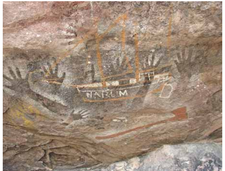
Tragedy? Modern Aboriginal art.

In several places the thin stick-like hunting figures, mimi spirits, said to live in the rock cracks, were painted in red ochre. These spirit figures are said by some to have been painted by the mimi spirits themselves and they are said to come out from their rock crack abodes in windless conditions and at night.