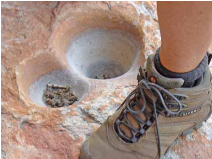
Ochre grinding hole in sandstone.

Aboriginal occupation of Australia is now known to stretch back for over 60,000 years. Throughout most of that time the aborigines have recorded their lives and culture on the walls and roofs of the countless rock galleries wherever they lived. In most places it is fair to say that they have added to or modified their art. If they hadn't rock erosion would have destroyed the art. What happens is that certain tribes are responsible for