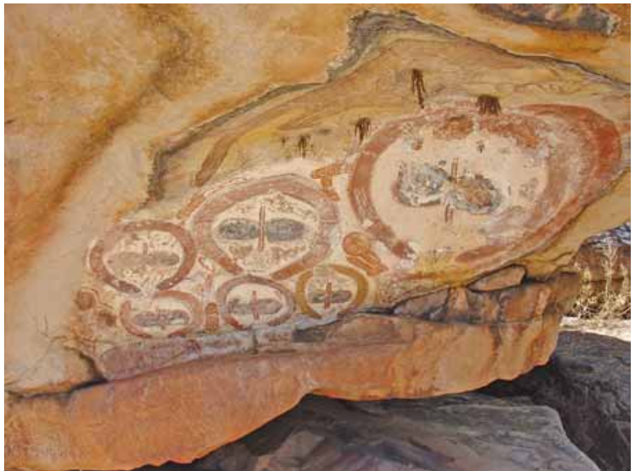
Wandjina Style Art. (note kangaroo at top).

Also present were the characteristic gwion figures (these are also called Bradshaw paintings after the European who drew attention to them) which are very distinctive in either tassel, clothes peg or sash style.